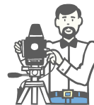
Photo Session for Pictorial Directory Tuesday, June 29 from 4:00-7:30 p.m. Call Church Office to schedule

An 8:30 a.m. Sunday service in the Chapel will be held during the month of June (service will be no more than 45 minutes in length).